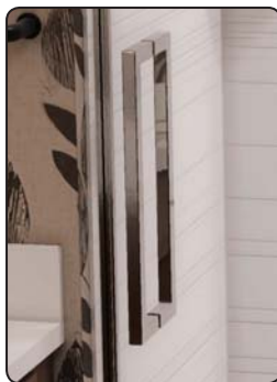
Back to Back Door Handle Dimensions: