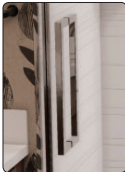
Back to Back Door Handle Dimensions: