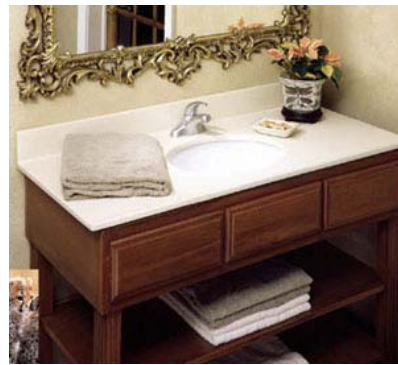
VT-12 on cabinet

Please read the following before attempting to install your vanity top: