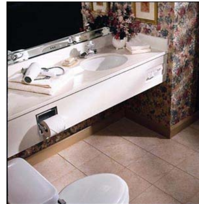
VT-02 with TPD and FTD

Please read the following before attempting to install your cast marble vanity top.