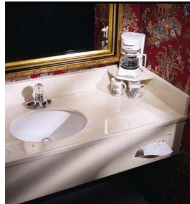
VT-04 with TPD and FTD

Please read the following before attempting to install your cast marble vanity top.