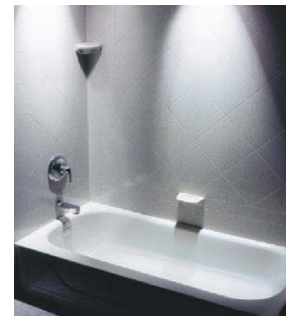
TS-DS/Gloss – 60"

Please read the following before attempting to install your cast stone gloss diamond tub surrounds.