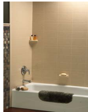
TS-VN/6 x 10 Bordeaux

Product number – TS-VN/6" x 10" Bordeaux