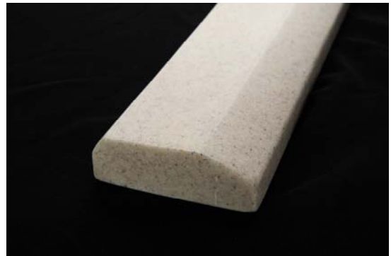
TH - F

Please read the following before attempting to install your new cast marble double bevel thresholds.